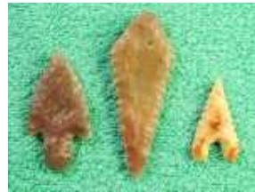
Various Capsian tools and weapons

Forum post contributed by Maju, March 10, 2008.