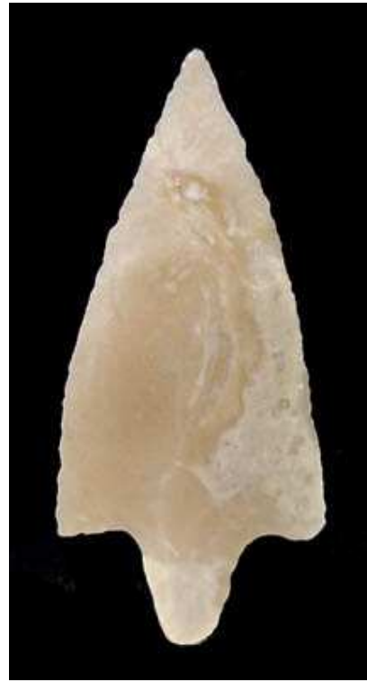
A beautiful Oranian arrow point