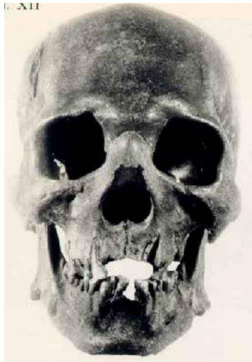
Oranian "Cro-Magnon" skull