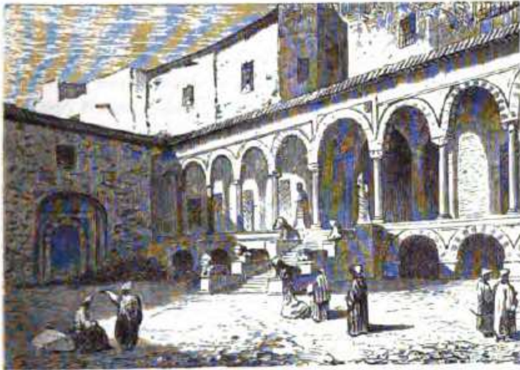
THE BARDO NEAR TUNIS.

kasbah, or citadel, on the west of the town, in spite of the rents in the walls of the great square central building, presents a somewhat imposing appearance from without. This impression, however, vanishes when we set foot in the interior, which offers to the eye little more than the spectacle of a vast heap of ruins, amid which the graceful minaret alone has been preserved in a good condition.