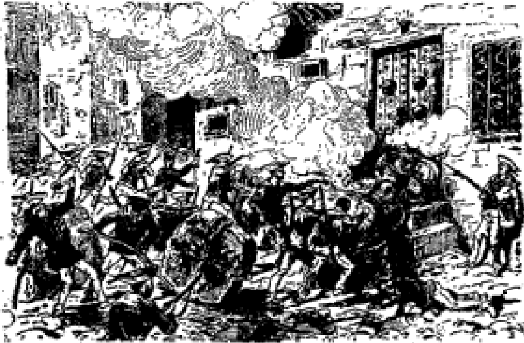
Sfax: Combat dans les rues : mort de l'aspirant Léonnet.