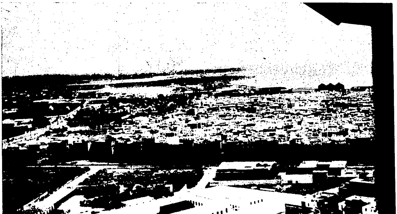
La ville arabe.

The exploitation of this immense wealth represented by the phosphate layers mined in Metlaoui, Tabeddit, Redeyeff and M'Dilla required the creation of a deep water port as close as possible